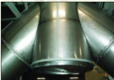
Exhaust Welded Breechings (above)

Pharmaceutical Hospitals Commercial/Institutional Universities/Colleges Industrial Treatment Plants Automotive Plants Food Industry