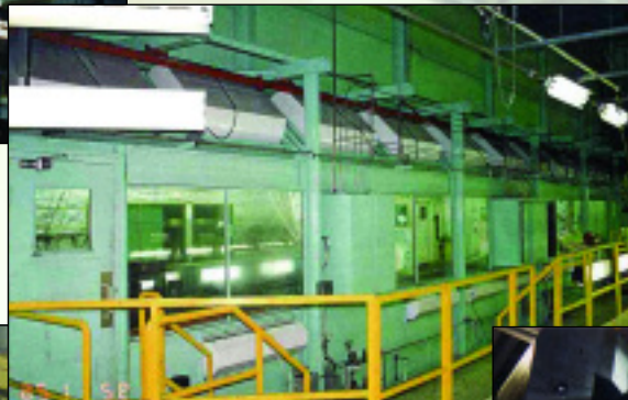
Installation Process of a Downdraft Repair Booth (above)