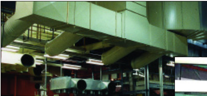
Complete Turnkey System of a Ventilated Welding Robotic Enclosure (above)