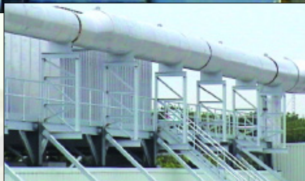
Breeching under Welded Construction Ductwork (above)