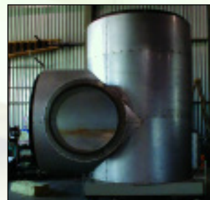
Insulated Breeching Shop Fabricated (above)