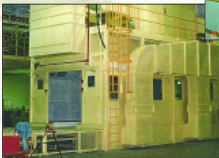
Complete Turnkey System of a Grind Booth (above)