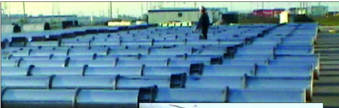
Welded Construction Ductwork (above)