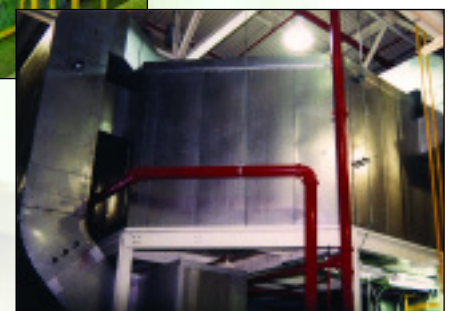
Fabrication & Installation of a Prime Oven Extension (above)