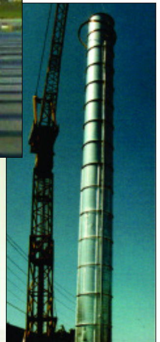
Fabrication & Installation of a 90 ft. Stack – Environmental Project (above)